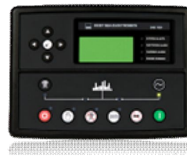
Control Panel By: