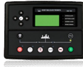
Control Panel By: