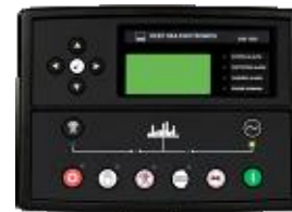
Control Panel By

Automatic engine starting & stopping Automatic shutdown on fault condition Custom graphical icon type display Provides engine and generator instrumentation Provides engine alarms and status information LED & LCD alarm indication Compatible with 5200, 5300 and 5500 series modules for easy upgrade path.